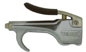
Brass Tip 605