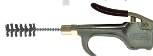
Steel Brush 801