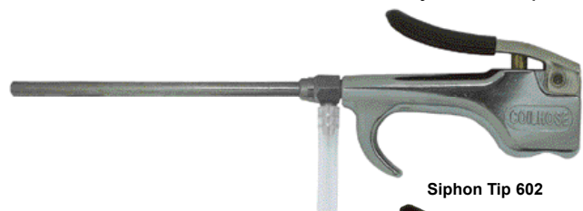
Siphon Tip 602