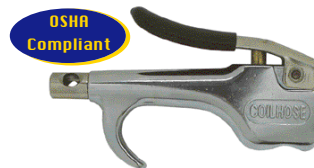
Safety (Standard) 600S-DL