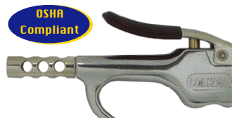
Safety Booster 600-SB