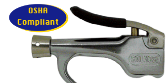
Safety Shield 600-SS