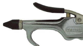
Rubber Tip 601