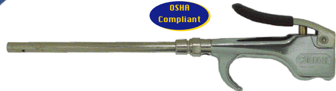
Safety Extension Tip 606-S