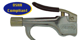
Tamper Proof 600-ST-DL