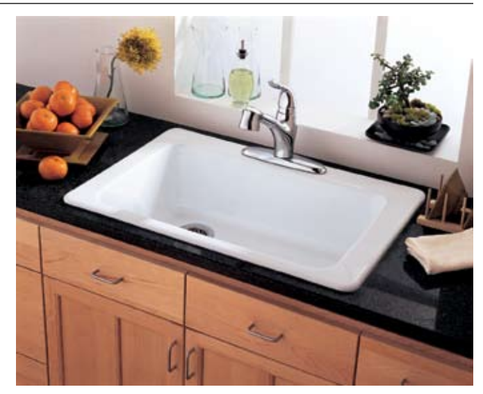
Shown with 4114.100 Lakeland Pull-Out Kitchen Faucet