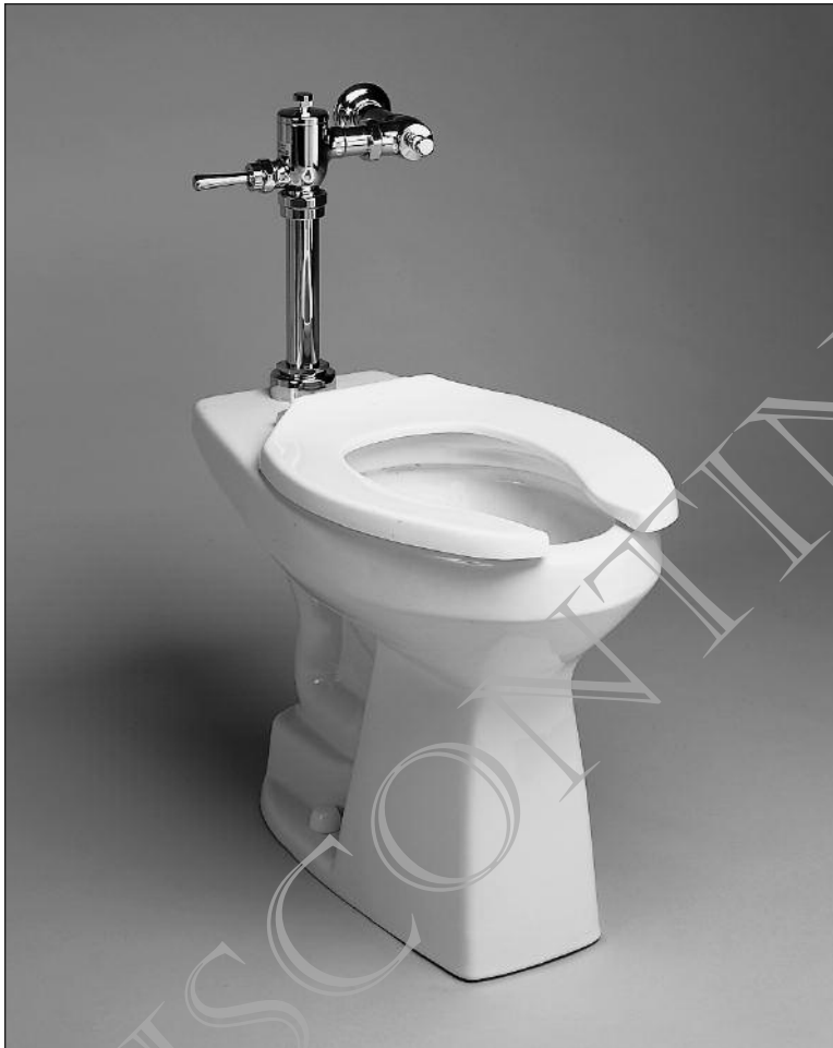
CT 705L - Flushometer Toilet - ADA Compliant SC534 - Commercial Toilet Seat TMT1HNC - 32 - Manual Toilet Flushometer Valve